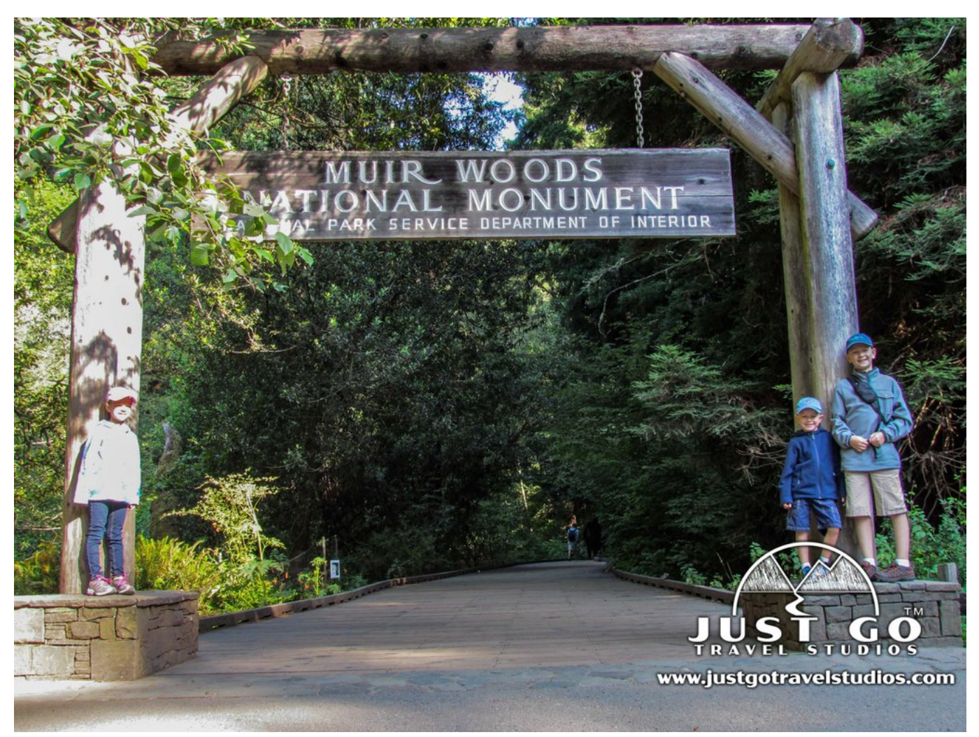
Hello December: My December Intentions.

Within Muir Woods National Monument, elevations range from 120 to 1,340 feet above sea level. Redwood Creek loses approximately 50 feet in elevation from ... <u>Hearts of Iron IV 1.6.2 Ironclad</u>